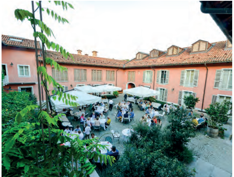
Terrace at Villa d'Amelia

The Villa d'Amelia is a charming renovation of an 18th Century estate, well situated in a tranquil location with striking views over the surrounding parkland and the Monviso Alps. The many traditional features in the communal areas, such as exposed beams and tiled floors, compliment the more contemporary furnishings of the 37 bedrooms. A highlight of the hotel is the excellent well-being facilities, including a Turkish bath and Finnish sauna as well as a heated outdoor swimming pool where guests can enjoy the magnificent views. In the evenings the hotel's Michelin-starred restaurant offers an array of modern interpretations of local specialties, paired with regional wines.