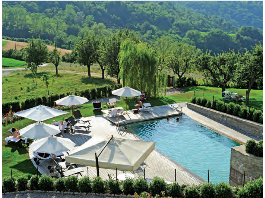
Swimming pool at Villa d'Amelia

It is possible to add extra nights in any of these destinations if you would like to spend more time there.