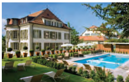
Hotel Angleterre et Residence