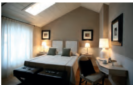
Deluxe room at Villa d'Amelia

On the shores of Lake Geneva with stunning views of the Alps, this hotel comprises of five different buildings surrounding the main Reception. The hotel offers contemporary style in a historic setting with parts of the buildings dating back to the 18th century. The 75 bedrooms and Junior Suites are scattered between four buildings, each with their own distinct styles, but all guests will benefit from the same high standards of care from the friendly, professional staff.